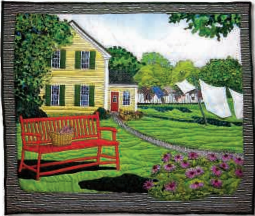
A Feeling Good Day